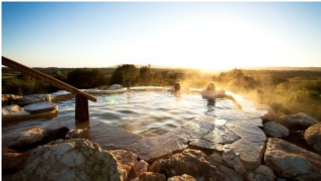
The Hilltop Bathing View at the iconic Peninsula Hot Springs in Australia's Mornington Peninsula, Victoria.

According to the Global Wellness Economy Monitor, Australia is in the top five wellness tourism markets in the Asia Pacific. Australia's clean, green environment; Indigenous plants with health properties; and an emphasis on cultural traditions create a competitive advantage for Australia as a destination for wellness tourism.